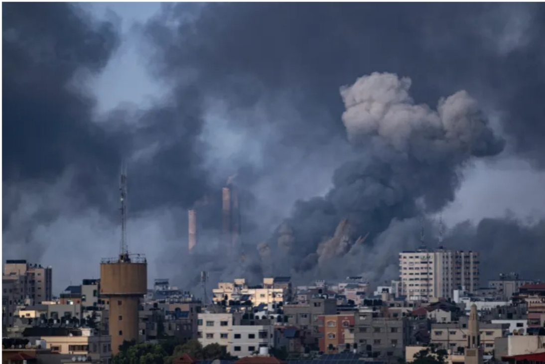
Smoke rises following an Israeli airstrike in Gaza City, Wednesday, October 11, 2023, as the enclave's only power station stopped working after Israel blocked supplies of fuel

Life-saving machines running on generators will soon stop working, amid Israel's refusal to allow fuel supplies into the enclave.