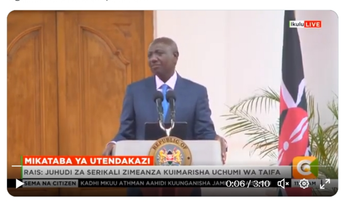
4:58 PM · Aug 1, 2023 · 519.3K Views

How do you run a department if you don't have knowledge? That is the highest level of incompetence.