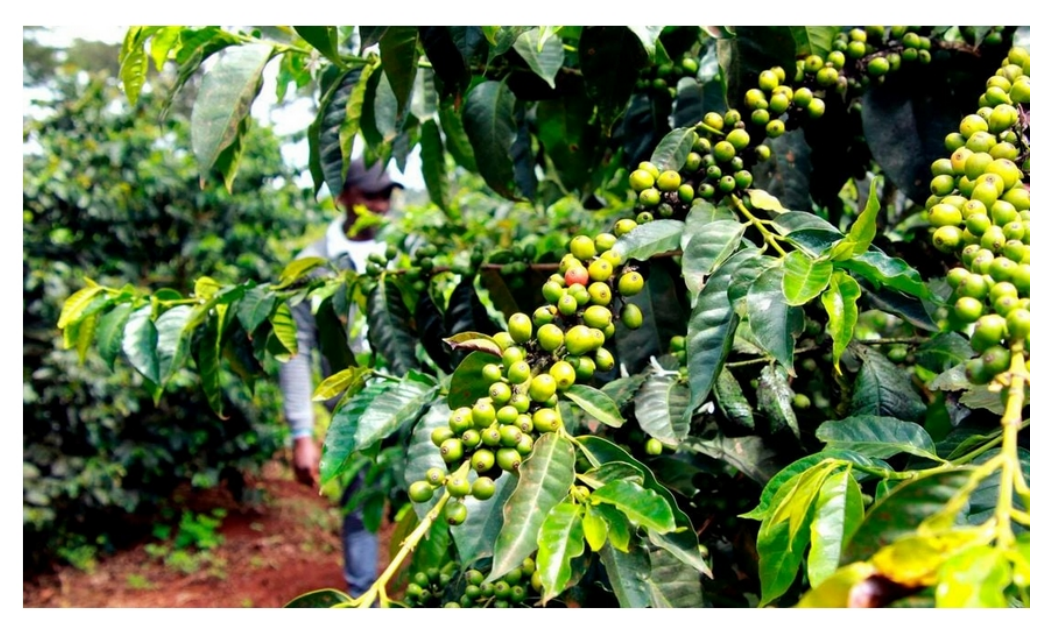
A farmer tends to a coffee bush in Nyeri town on May 10, 2023. Coffee, macadamia, rice, tea and avocado have recorded a drastic drop in prices in recent months as powerful cartels invade the agriculture sector, threatening the livelihoods of thousands of farmers nationwide.